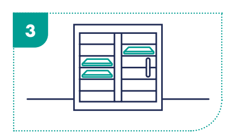
Remove caps from the dedicated Conti<sup>®</sup> Warmer, or use at room temperature.